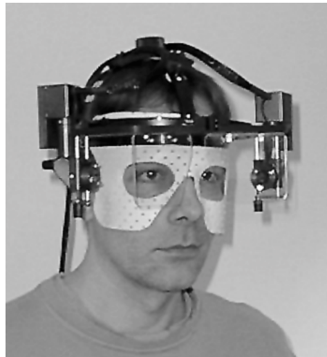
Chronos Eye Tracker head unit.